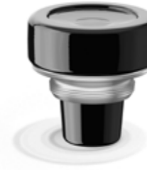
VL Black HT