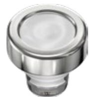
Metal coating - Silver