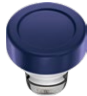
Colour coating - opaque