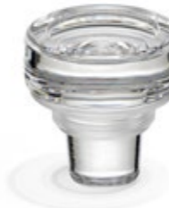
VL Clear HT