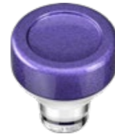
Colour coating - metallic