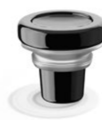
VL Black LT