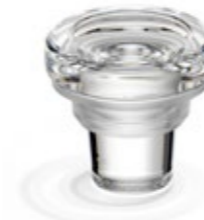
VL Clear LT

(7x29.3) = height x width of the closure head in mm LT = Low Top, HT = High Top