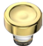
Metal coating - Gold