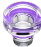
Coloured sealing ring