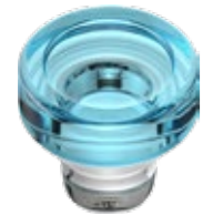
Colour coating - transparent