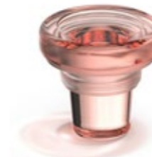
VL Rosé LT